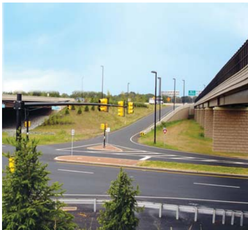
Construction Engineering, Administration and Inspection for Route 18 Extension / Rutgers Improvements - NJDOT 2006 ACEC Patinum Award Winner