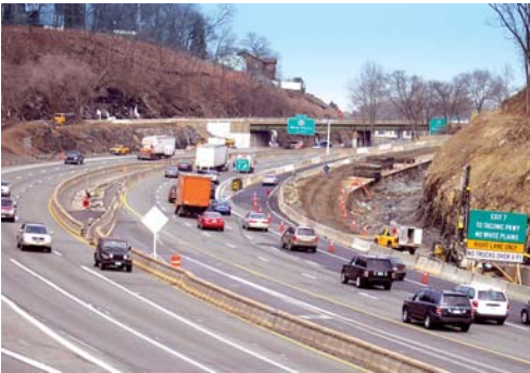
Construction Inspection Services for Westchester Expressway – NYSDOT