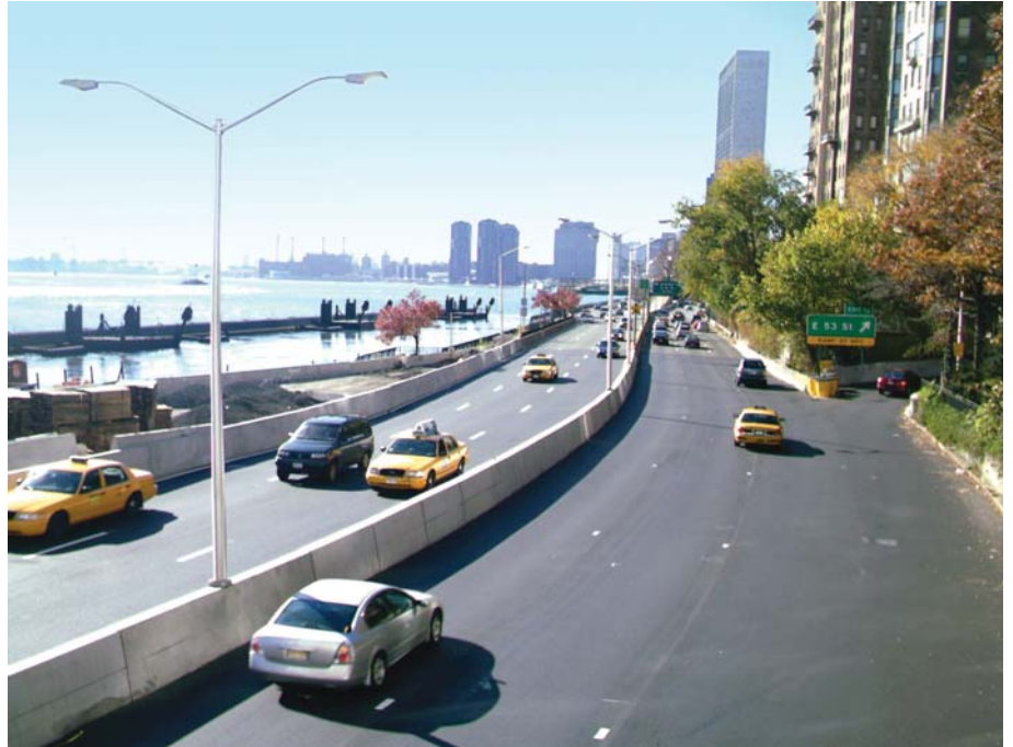
Construction Inspection for FDR Drive SB (E. 56 th to E. 64 th St.) Reconstruction - NYSDOT