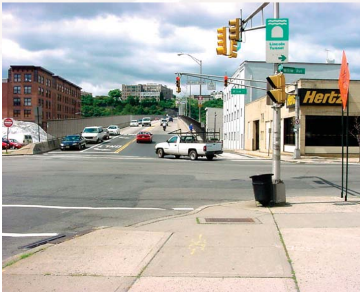
14 Street Viaduct Design in Hoboken - Traffic Engineering & Survey Services - Hudson County

KS Engineers, P.C. ( KSE ) provides a full range of professional engineering, design and survey services customized to be compatible, environmentally sensitive, economically feasible and community focused in meeting our clients' needs and objectives. We work in partnership with our state, county, local and institutional clients to deliver the best possible solutions to today's difficult challenges on toll roads, interchanges, controlled access highways, park and rides, arterial highways, country and municipal roadways and streets, and inner-city networks. From concept development and preliminary engineering, including design alternatives and context sensitive solutions, through final design and construction support, KSE has the knowledge, experience and understanding to deliver high quality, sustainable engineering solutions for improved mobility and economic vitality.