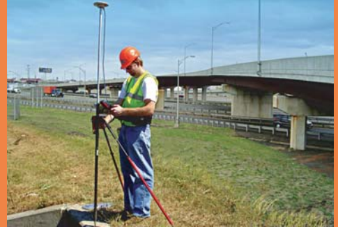
GIS Mapping and Inspection of over 5000 Drainage Outfalls on the Garden State Parkway & New Jersey Turnpike 2007 ACEC National Finalist Award