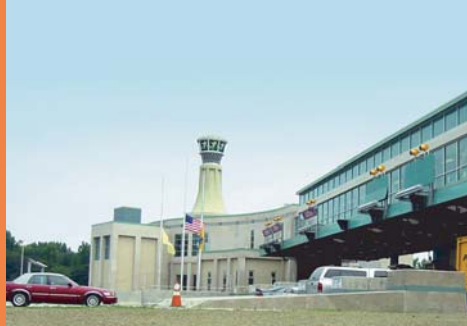
Construction Inspection Services for NJ Turnpike Interchange No. 1-NJTA