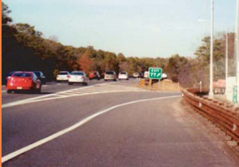
Garden State Parkway Interchange 77- NJTA