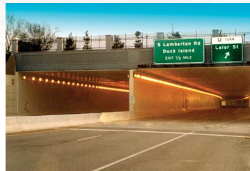
Route 29 Tunnel, Signalized Intersections, Roadway Lighting Design - NJDOT