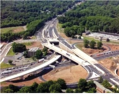
Construction Inspection for Route 1 & 130 – NJDOT